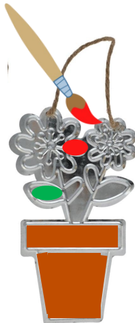
(NO CRAFT CLASS 3/15)