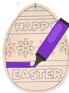
Easter Egg Decoration 3/29