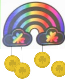
Rainbow Scratch Art Mobile 3/1

Sponsored by the Friends of Carver COA Wednesdays at 10:00 am Please register 508-866-4698 x3. Supplies may be limited.