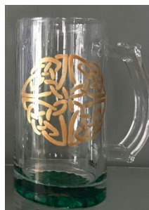
Celtic Knot Painted Beer Mug 3/8