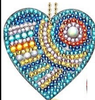
Diamond Art Key Chain 8/17