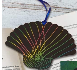
Sea-themed Scratch Art 8/3

Sponsored by the Friends of Carver COA Wednesdays at 10:00 am Please register 508-866-4698 x3. Supplies may be limited.