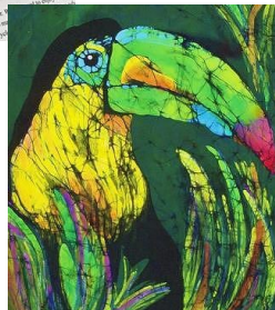
"Batik" Toucan 8/10