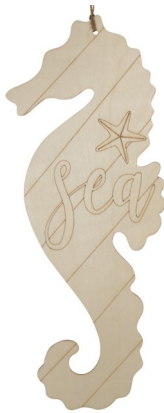
Embellished Sea Horse 8/31