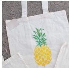
Stenciled Mini Tote 8/24