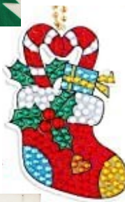
Diamond Art Ornaments 12/14