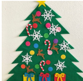
Felt Trim-a-Tree 12/17

Sponsored by the Friends of Carver COA Wednesdays at 10:00 am Please register 508-866-4698 x3. Supplies may be limited.