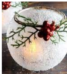
Frosted Tea Light 12/28