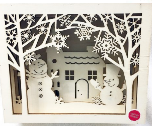
Holiday Shadow Box 12/21