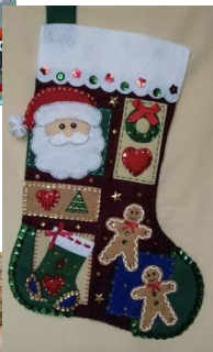
"Ugly Sweater" Stocking Design 12/13