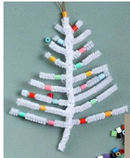
Pipe Cleaner Ornaments 12/6