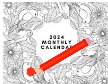
Adult Coloring Calendar 12/27