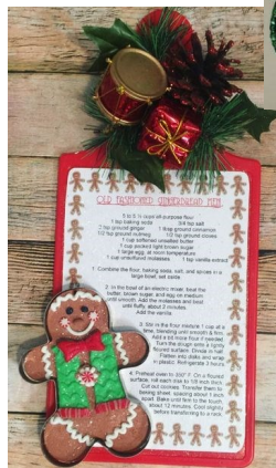
Gingerbread Cutting Board Decoration 12/20