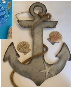
Embellished Anchor 7/26