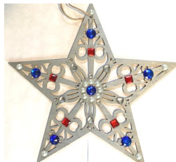
Spangled Star 7/5

Sponsored by the Friends of Carver COA Wednesdays at 10:00 am Please register 508-866-4698 x3. Supplies may be limited.