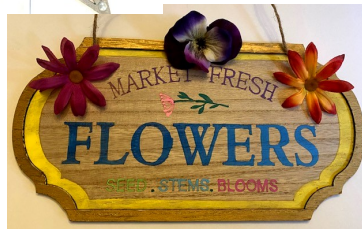
Floral Sign 7/12