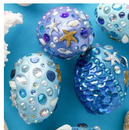
Mermaid Eggs 7/19