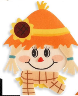
Scarecrow Magnets 10/12