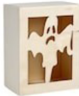
Halloween Tea Lights 10/26