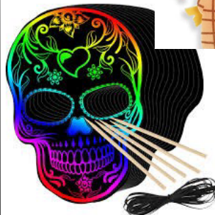
Scratch Art Sugar Skulls 10/19