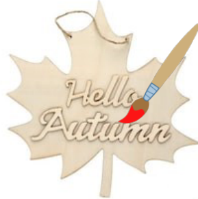
Painted Leaf Sign 10/5

Sponsored by the Friends of Carver COA Wednesdays at 10:00 am Please register 508-866-4698 x3. Supplies may be limited.