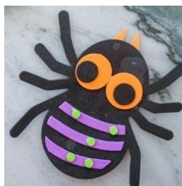
Spider Magnet 10/25