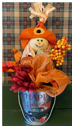
Fall Centerpiece 10/4