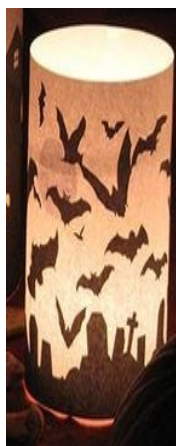
Spooky Decoupage Candle 10/18