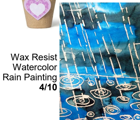
Wax Resist Watercolor Rain Painting 4/10