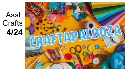
Asst. Crafts 4/24