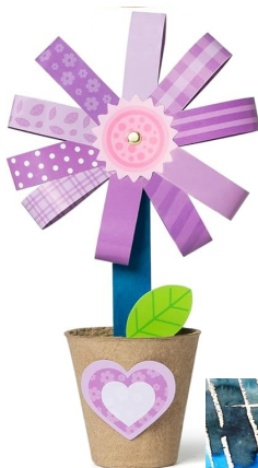
Paper Flower Pots 4/3

Wednesdays at 10:00 am Must register by the Monday before at 508-866-4698 x3. Supplies are limited.