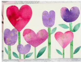
Watercolor Valentines 2/1

Sponsored by the Friends of Carver COA Wednesdays at 10:00 am Please register 508-866-4698 x3. Supplies may be limited.